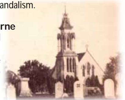
Detail from Postcard (1840-1860)